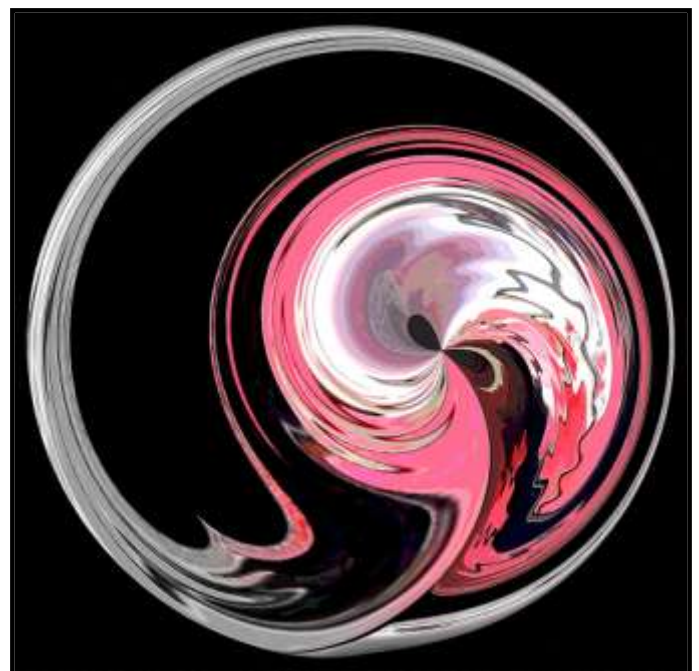
Fire Pot , © TERRIL THOMPkins

Fire Pot, 3 rd Place Winner, Print, Open, Amateur