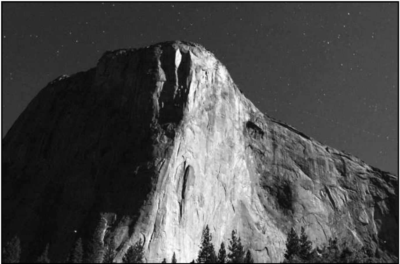
El Capitan Moonlight