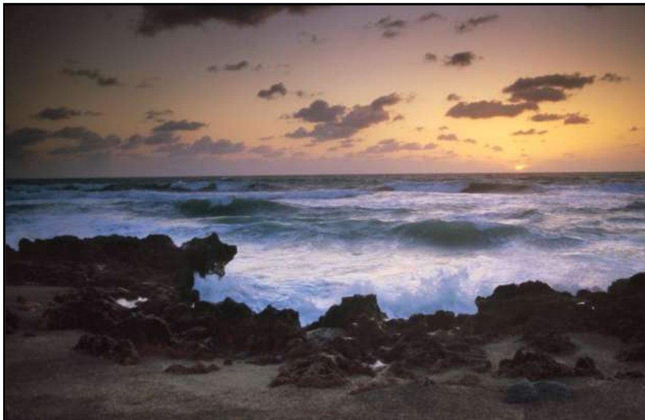
Amazing Sunrise