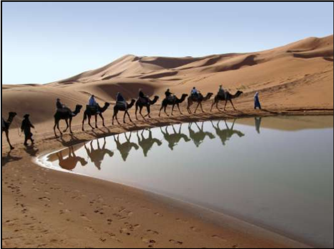
Camel Train