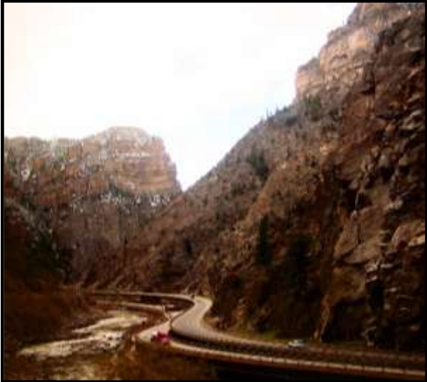
Ruby Canyon Curves , © BARB DANIEL

Ruby Canyon Curves: 3 rd Place Winner, Digital, Open, Amateur