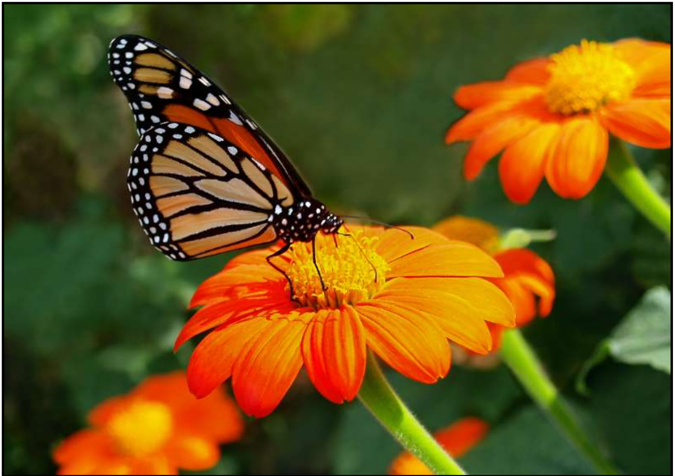
Orange Beauties , © CYNTHIA OLESZKEWICZ

Orange Beauties : 1 st Place Winner, Digital, Open, Amateur