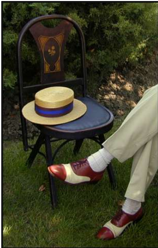
Steppin' Out , © TIM KELLMAN

Fire Pot, 3 rd Place Winner, Print, Open, Amateur