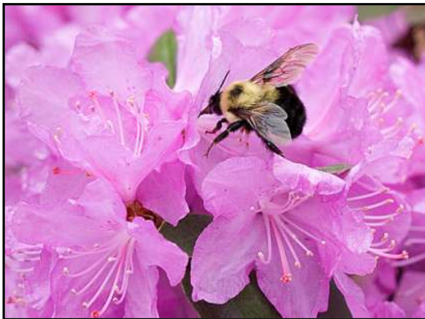
Bee on Azalea , © SANDY LABANA

Bee on Azalea : 3 rd Place Winner, Print, Assignment, Experienced