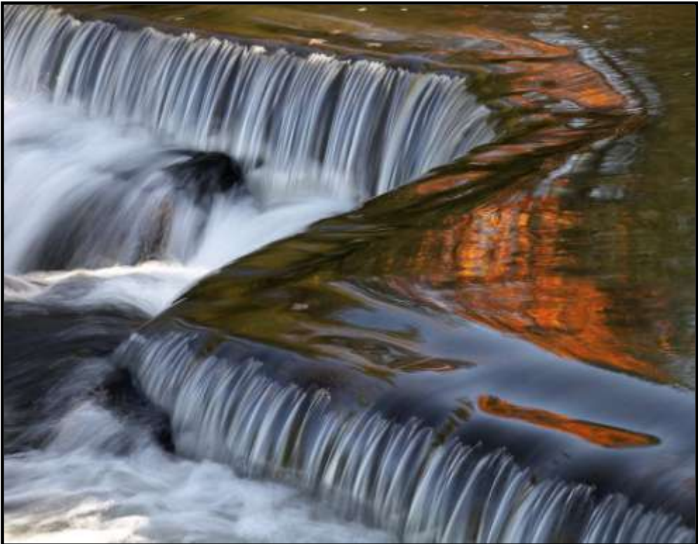
Stream of Color: 3 rd Place Winner, Digital, Open, Experienced