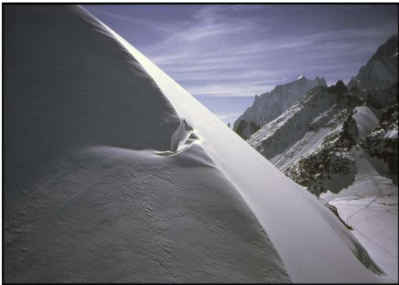
Snowscape, Chamonix , © JIM ARNS