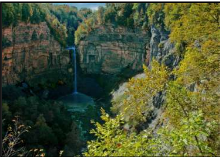
Taughannock Falls

Mt. Rainier Reflection: 1 st Place Winner, Print, Open, Experienced