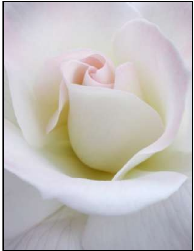
Rose

Steppin' Out: 2 nd Place Winner, Print, Open, Experienced