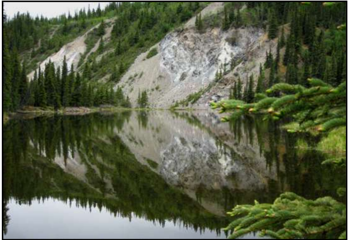
Horseshoe Lake